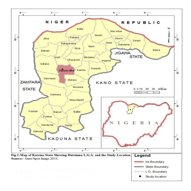
Fig. 1: Map of Katsina State Showing Dutsin-ma LGA.